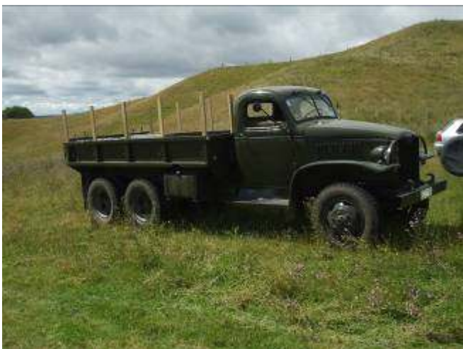
Transport supplied by Dave Cross