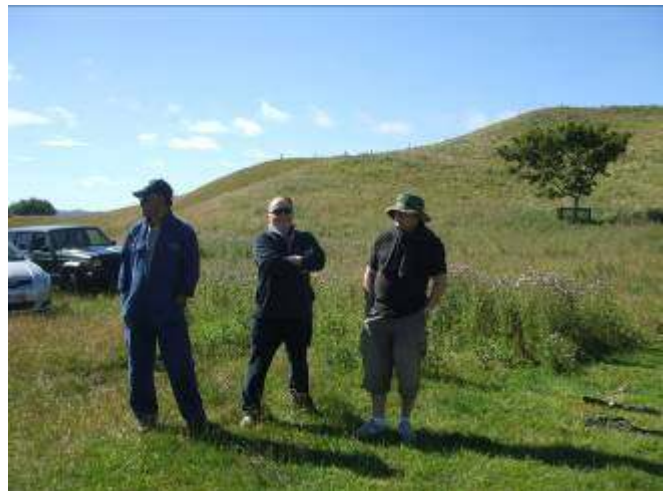
The three wise men