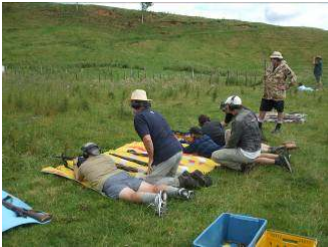
The seniors NEED supervision