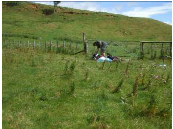
The kids' only need direction