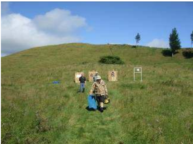
Setting up the targets

The shooting day was held at Coster's Farm on Sunday 24 th January 2010 Followed by Luncheon at the Kaimai Restaurant The following are some of the happy events.