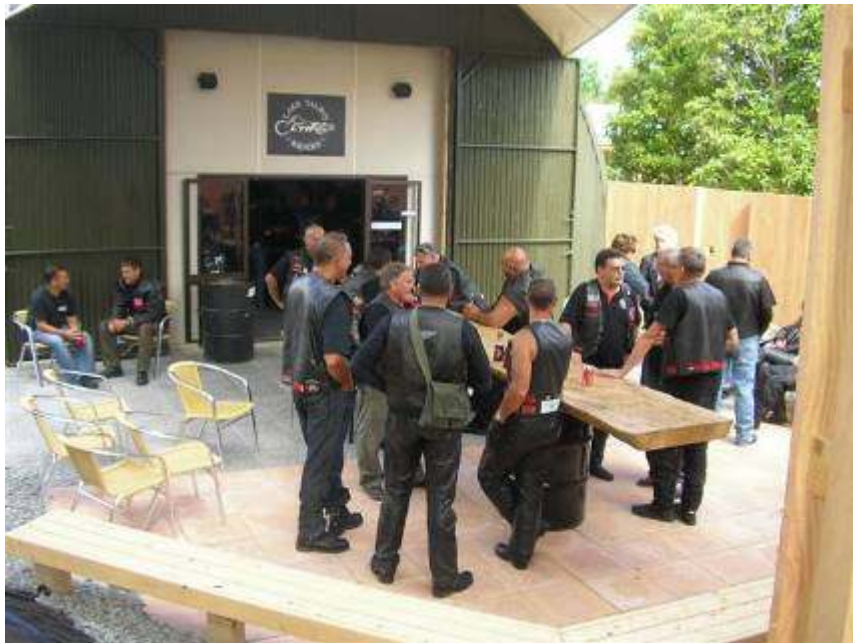
Patriots AGM held in Taupo