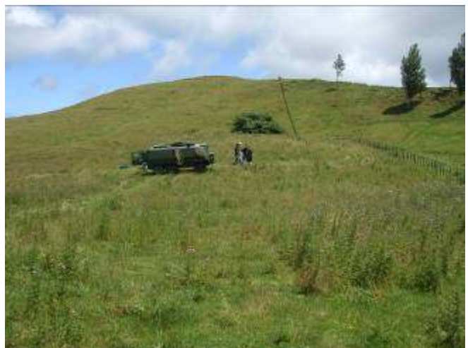
is that bullet proof?