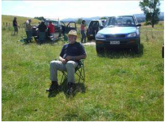
I am the one running the show