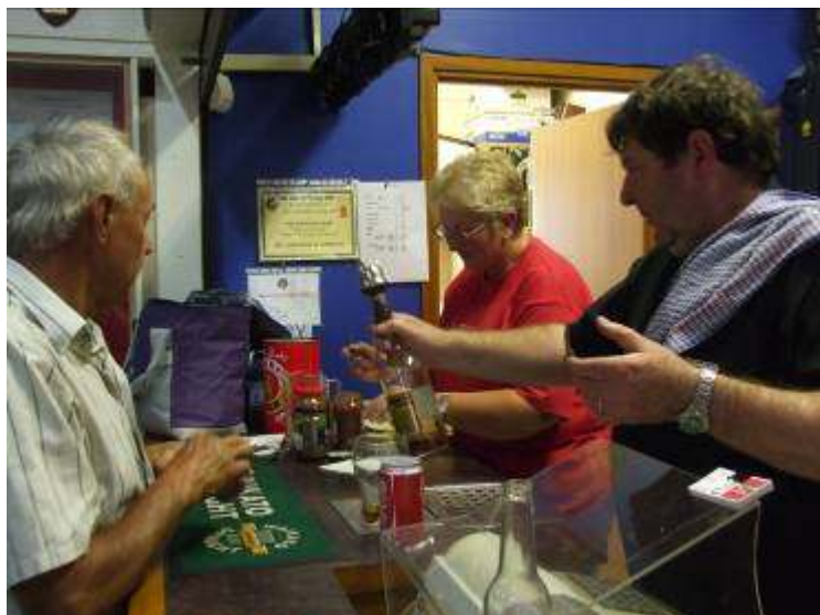
Guess who is first in the queue for curry?