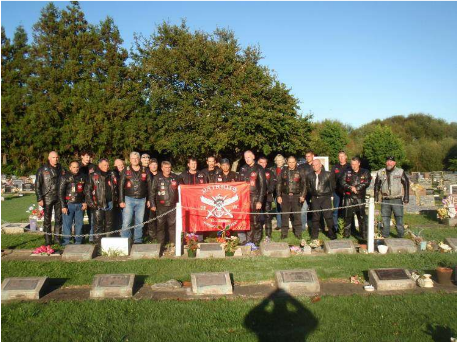
Patriots DFMC honour fallen Hauraki comrade.