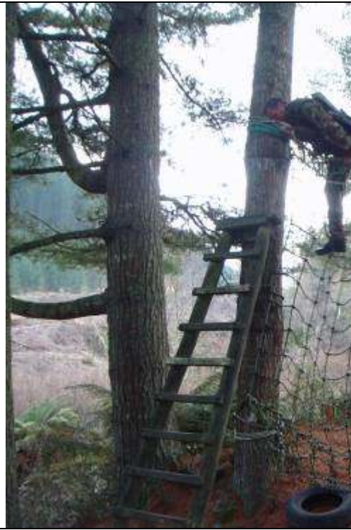
Troops negotiating concourse after