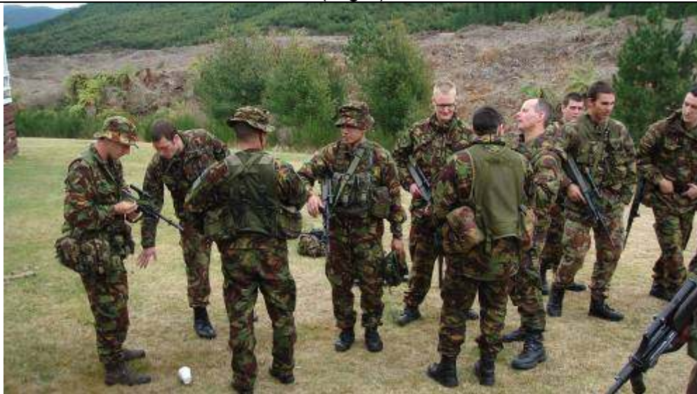
Troops take a quick break....