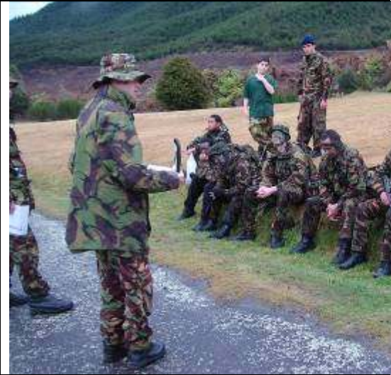
Patrol debrief aft