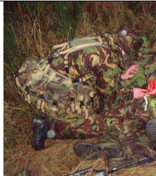
C/S 11B tends to IED casua