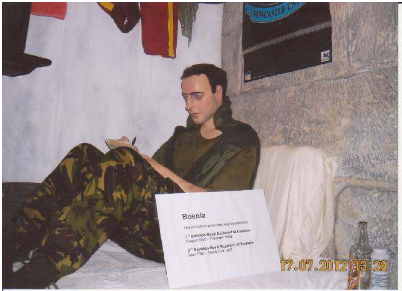
Audio Visual Display – Narrating the letter he is writing.