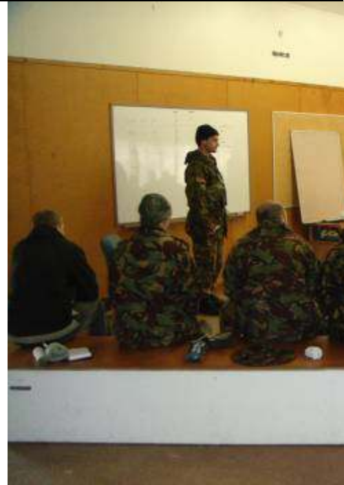
Medical training w