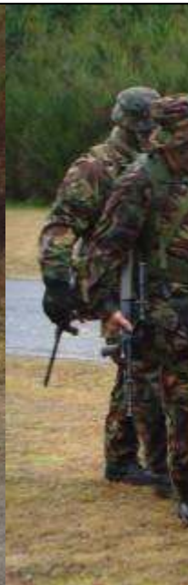
Walking wounded and stretcher casualty are extracted back to FOB by C/S