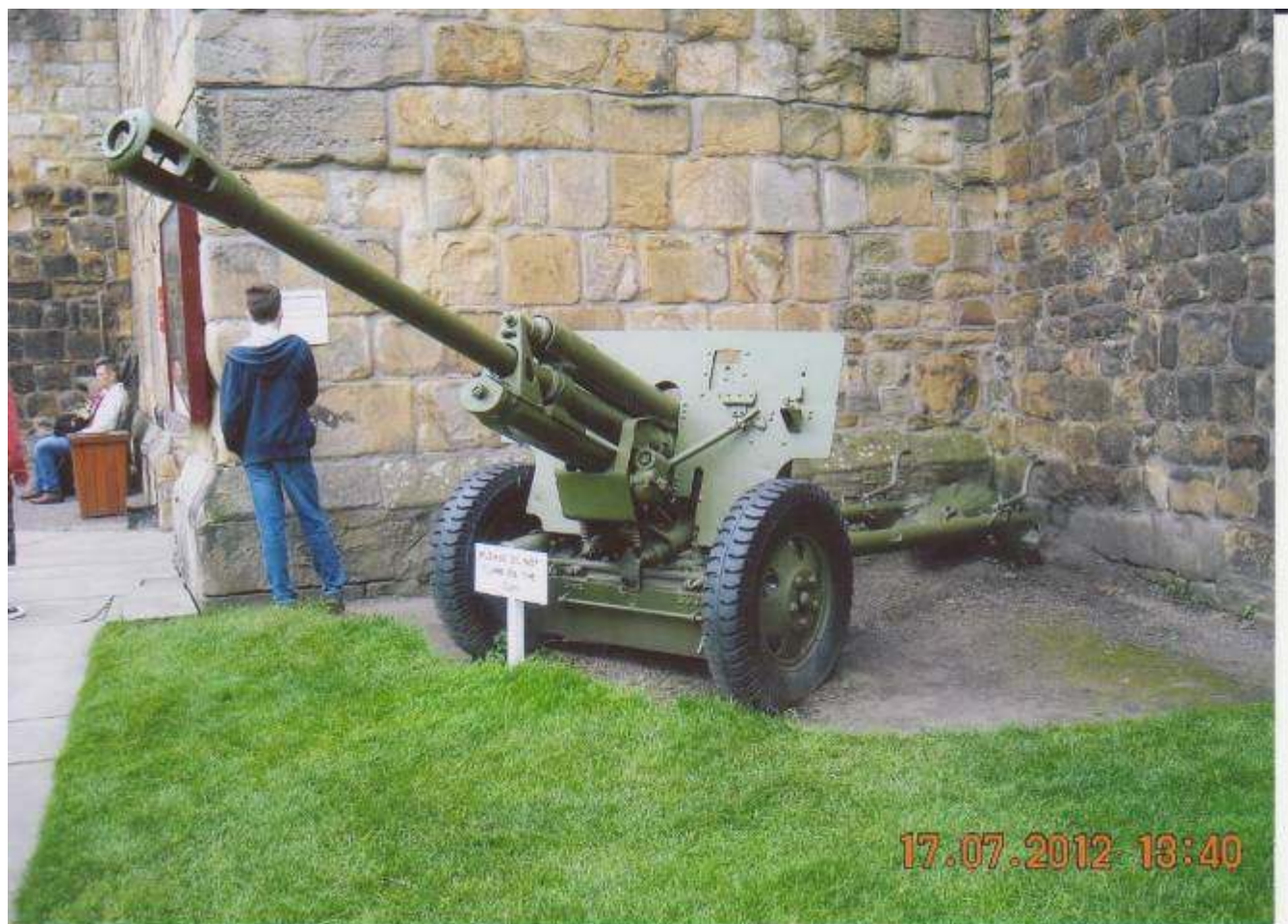
Gun captured in Bosnia