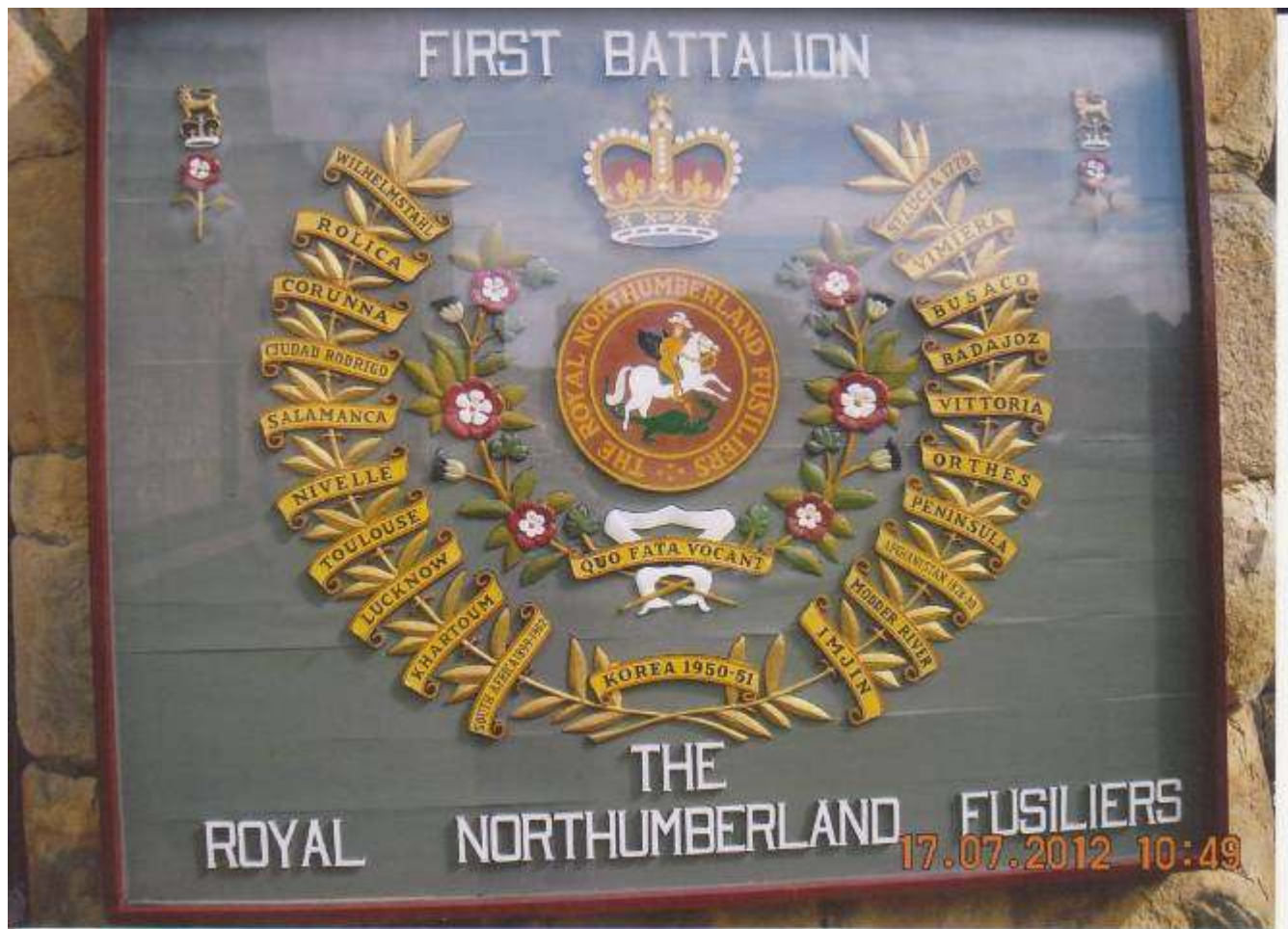
At the entrance to the Museum in Alnwicil Castle, Northumberland