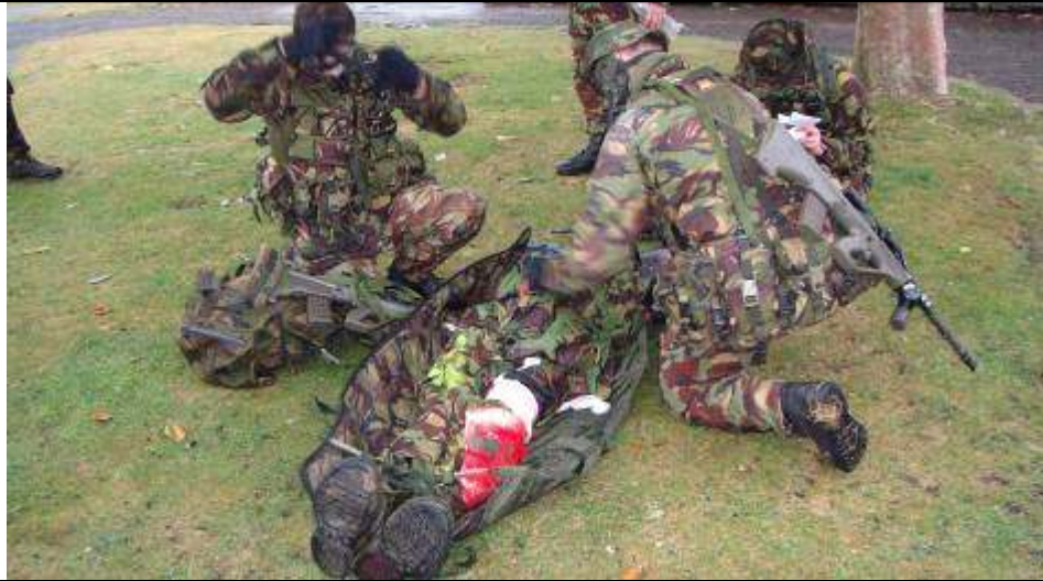
Casualty safely returned to FOB