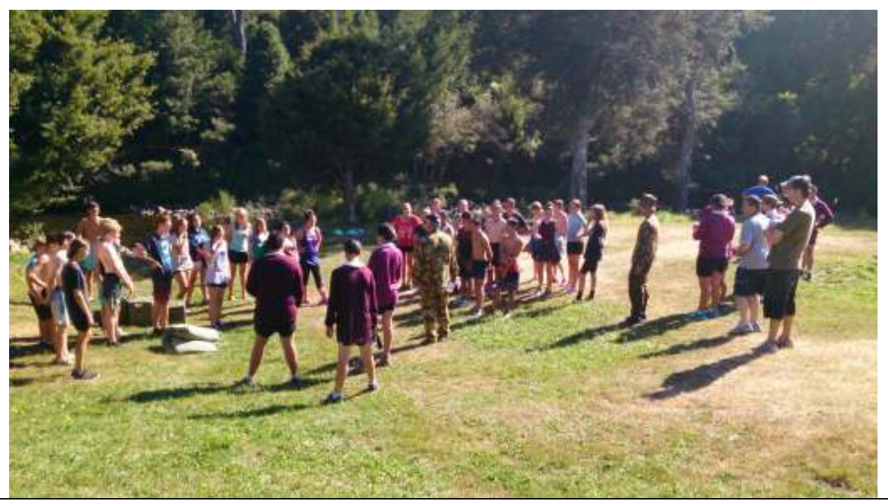
A HAURAKI TRAVELS TO AUSTRALIA

Hi des, hope you are well, here is the article prepared for the Australian army news regarding the Tasman exchange.