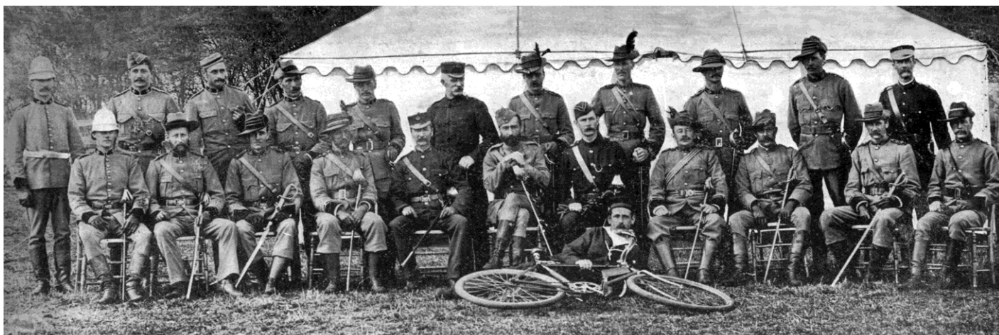
Officers of the Hauraki Regiment.