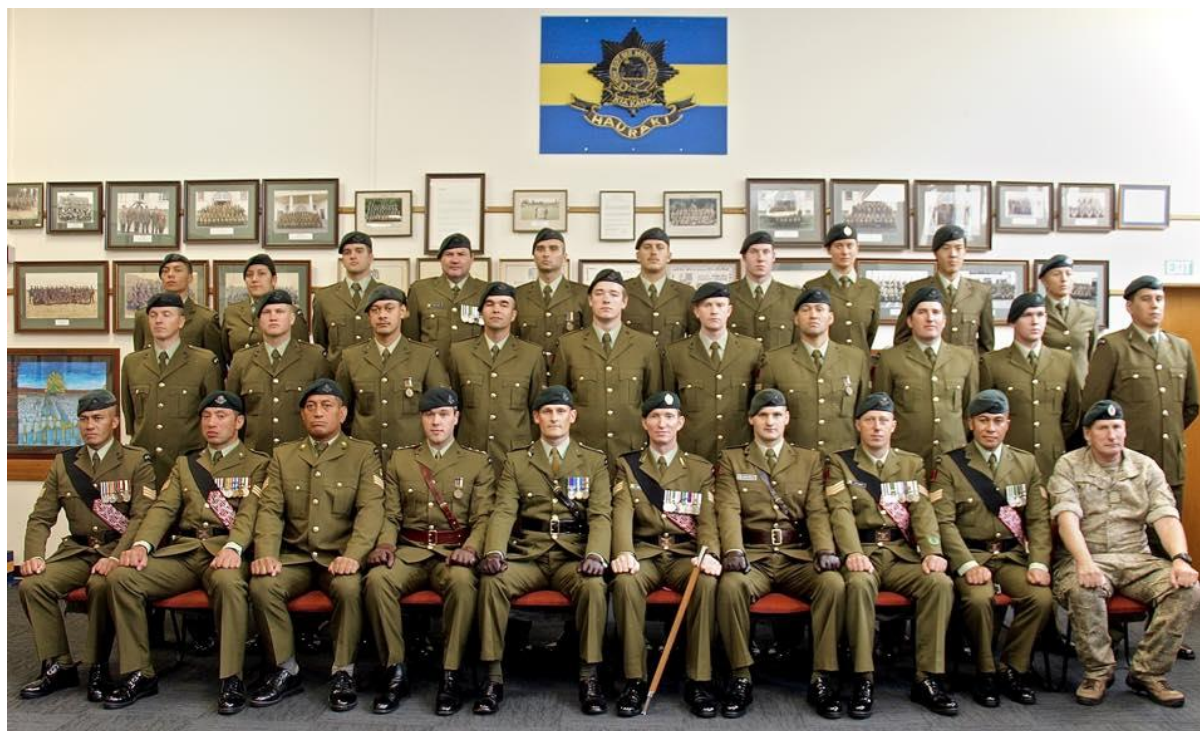
Hauraki Company at Leadership Training Course in Tauranga