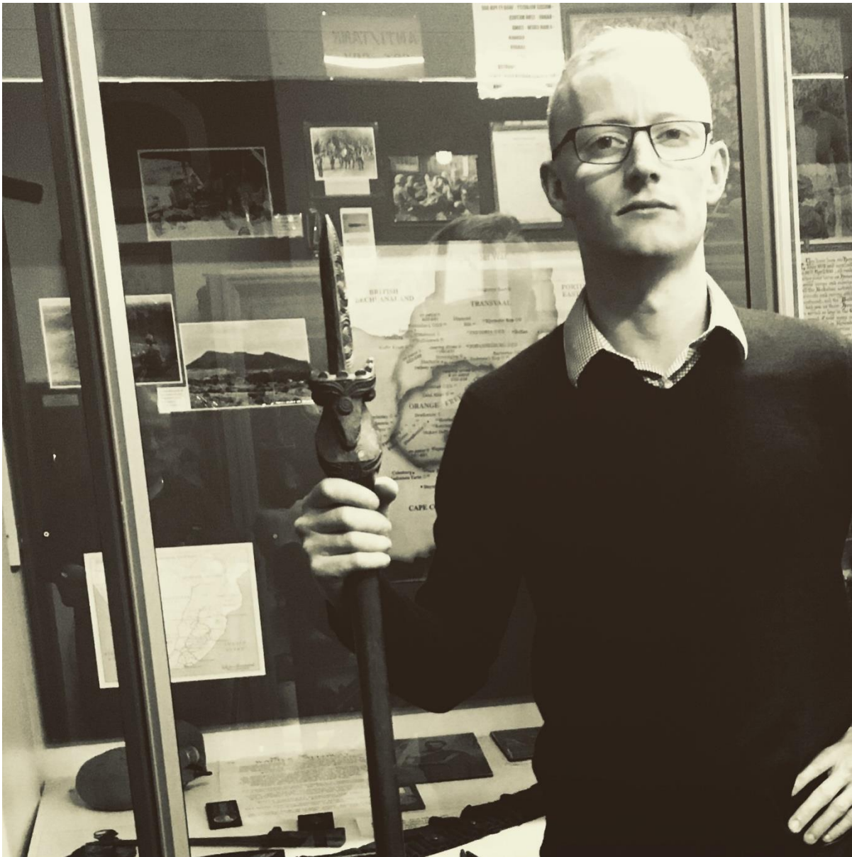
6 Hauraki Association Museum