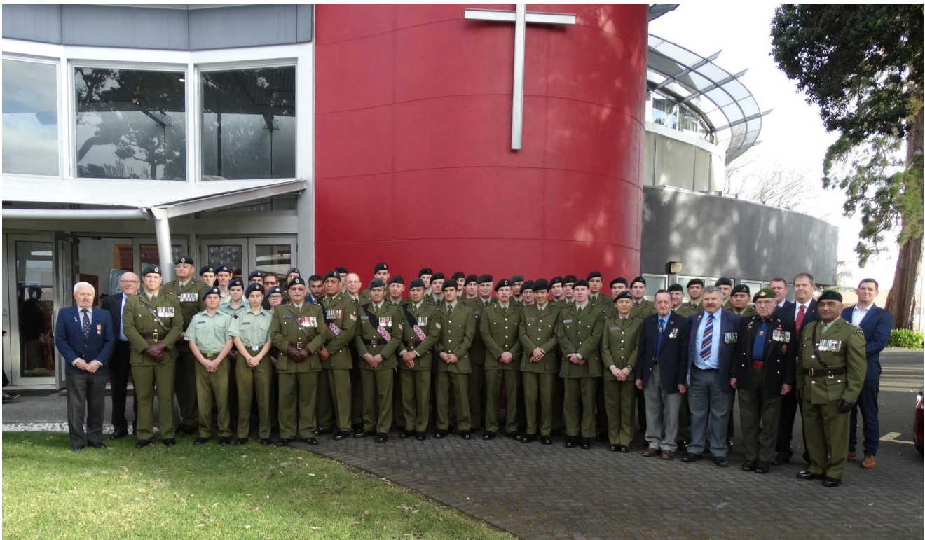
Members of 3/6 Bn - Hau Coy, Association members and Cadets of WBOPCU. Commemorating the milestone of 120 years from the date we recognize as the forming of the Hauraki's. 9 July 1898.