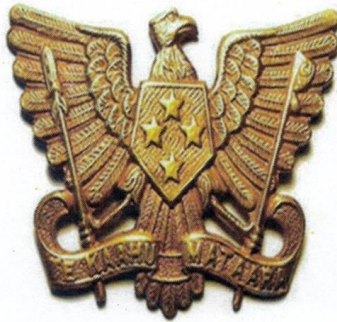
Te Kaahu Mataara (Be like a hawk)

A little background history of the Auckland Mounted Rifles.