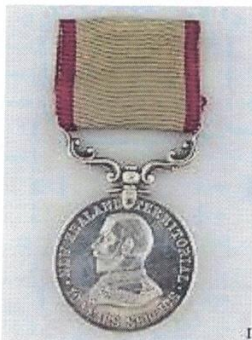
Territorial Service Medal