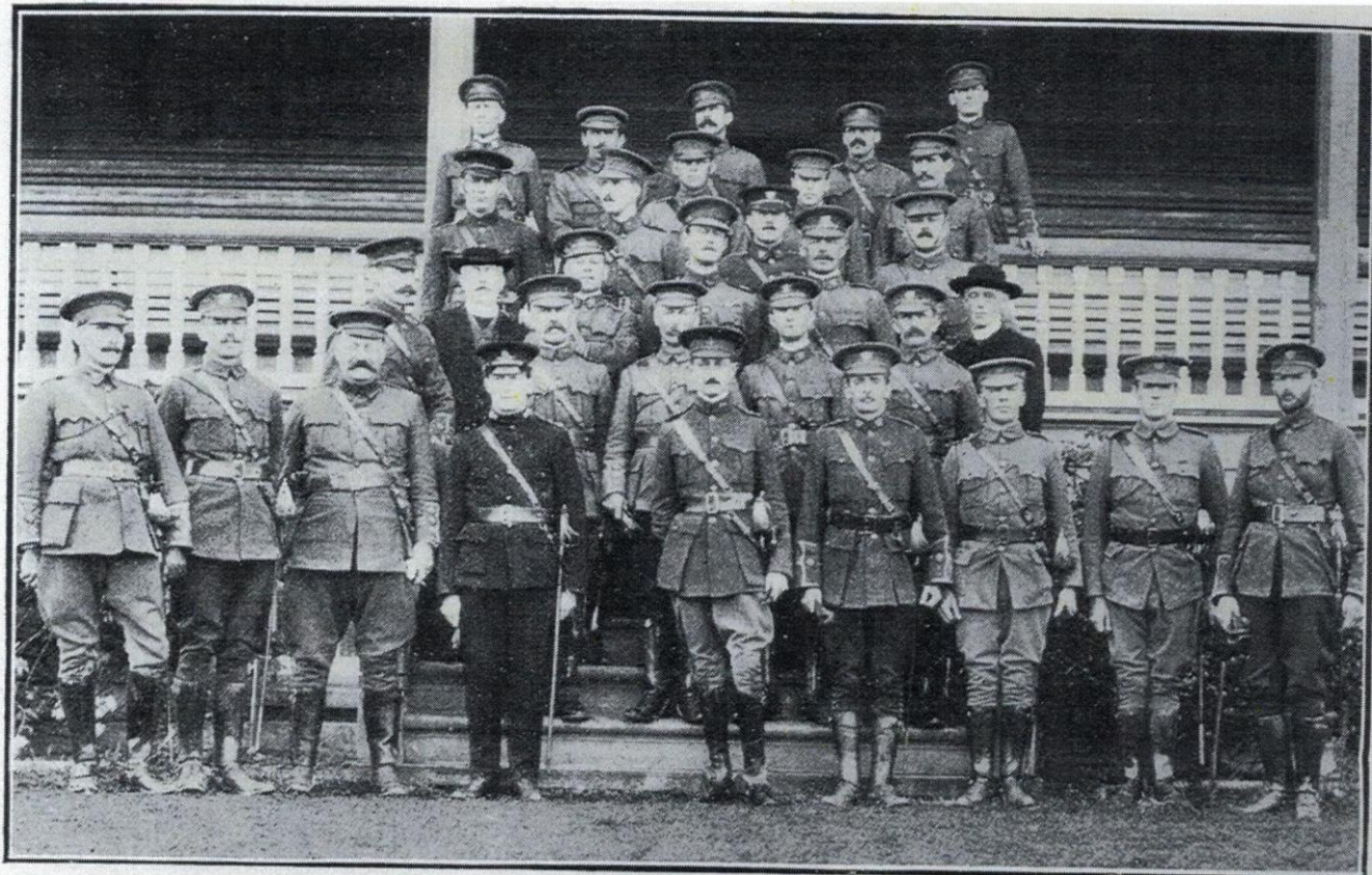
THE COMMANDANT VISITS THE AVONDALE CAMP: GENERAL GODLEY, WITH OFFICERS OF THE 3RD (AUCKLAND) MOUNTED RIFLES AND OF THE DISTRICT STAFF.