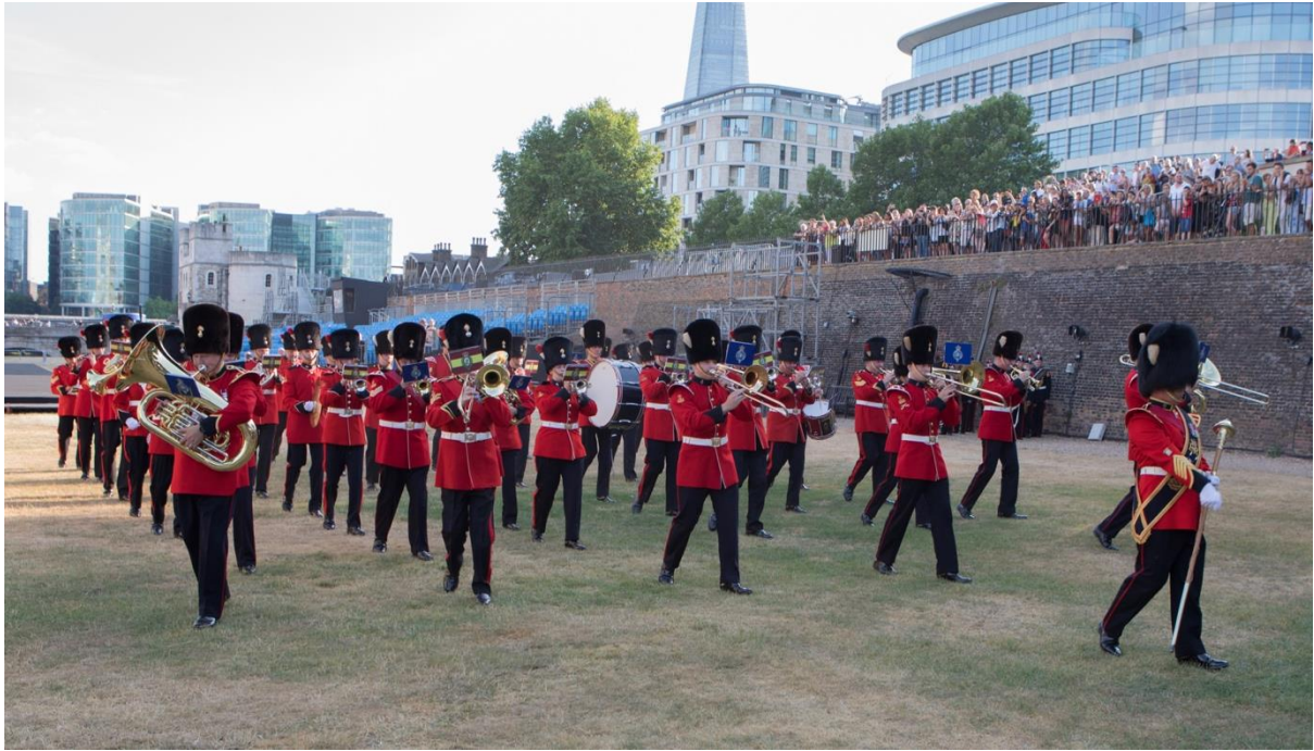
Beating Retreat ceremony by the Band of the Queen's Division and the RRF Corps of Drums