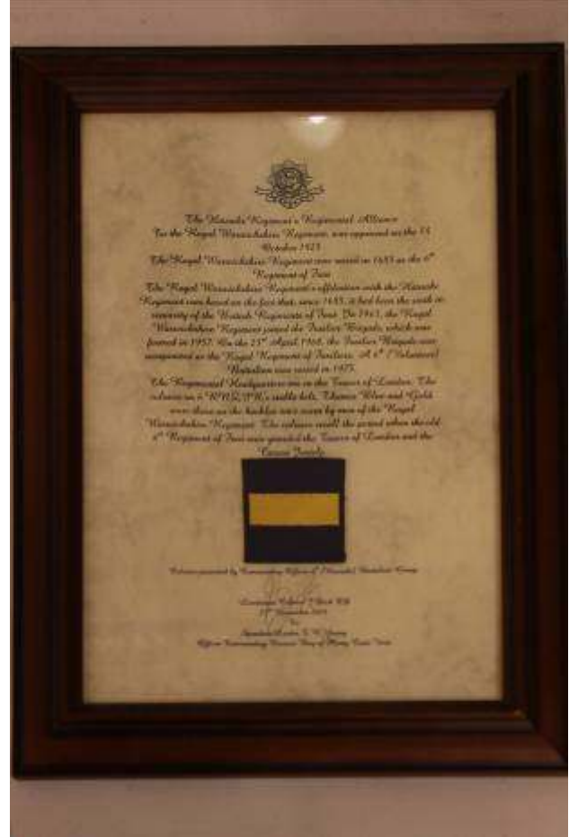
WBOPCU received permission to wear the Hauraki colours behind their badge