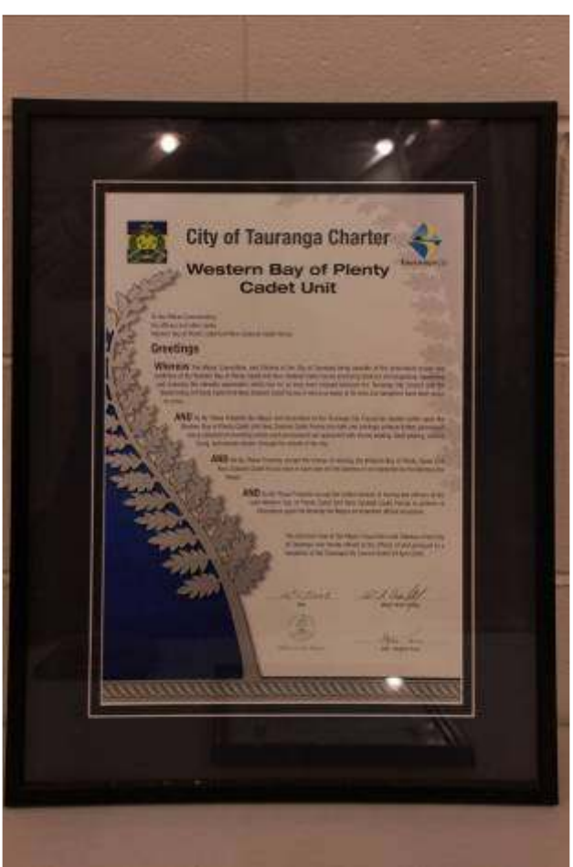
WBOPCU received the freedom of the city of Tauranga