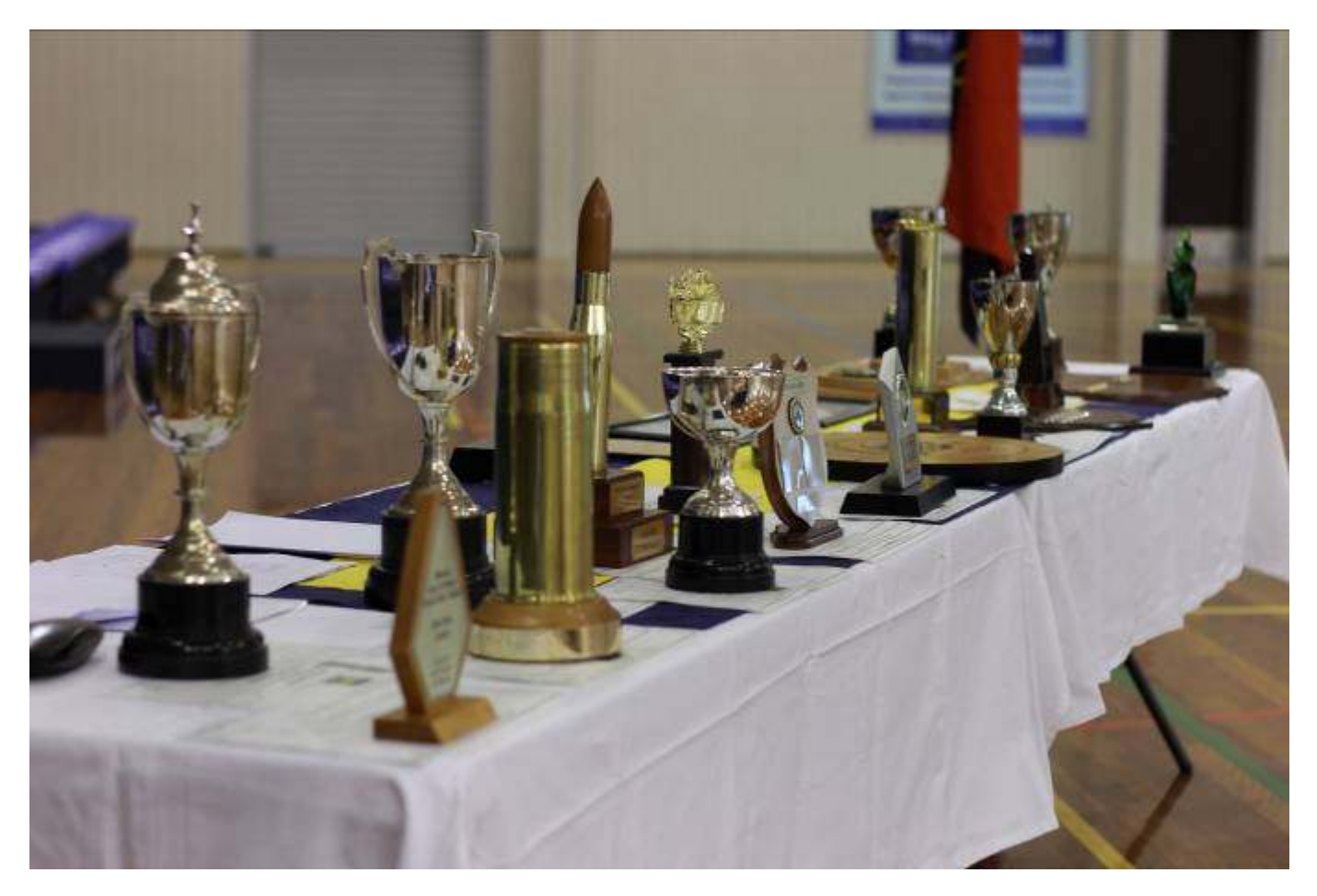
Some of the trophies to be presented to the cadets