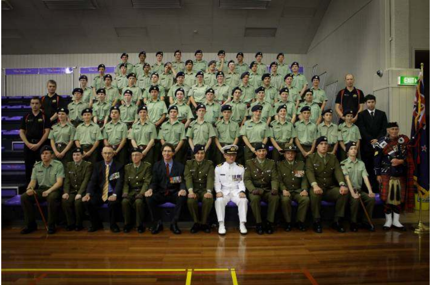
Western Bay of Plenty Cadet Unit -2012