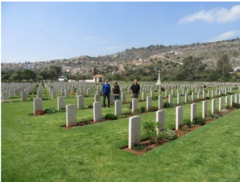
Caption: a view of the Suda Bay Commonwealth War Graves Cemetery in Crete.