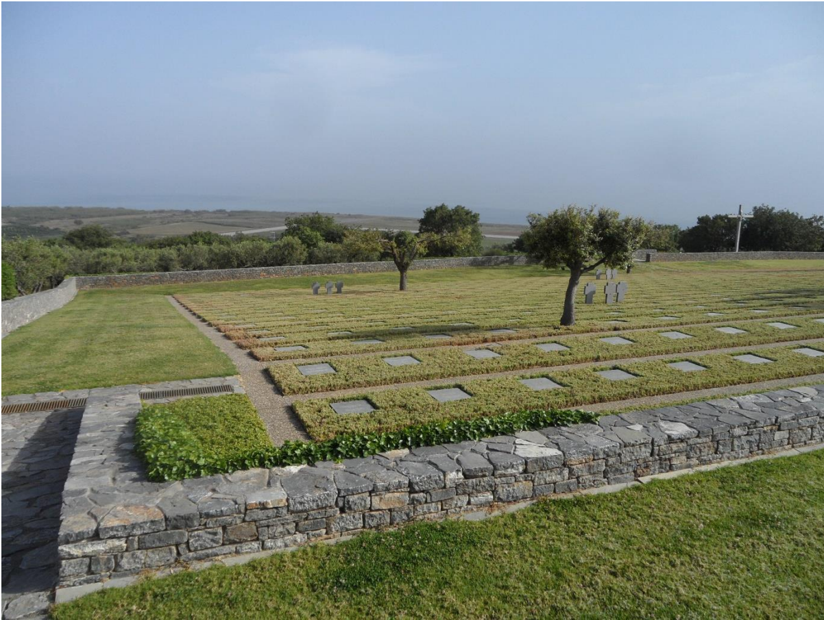
Caption. The German Cemetery on Point 107 overlooking Maleme airstrip – Crete

Readers may recall that I canvassed for any person who wanted a token of remembrance placed at a relative's grave in Greece or Crete.