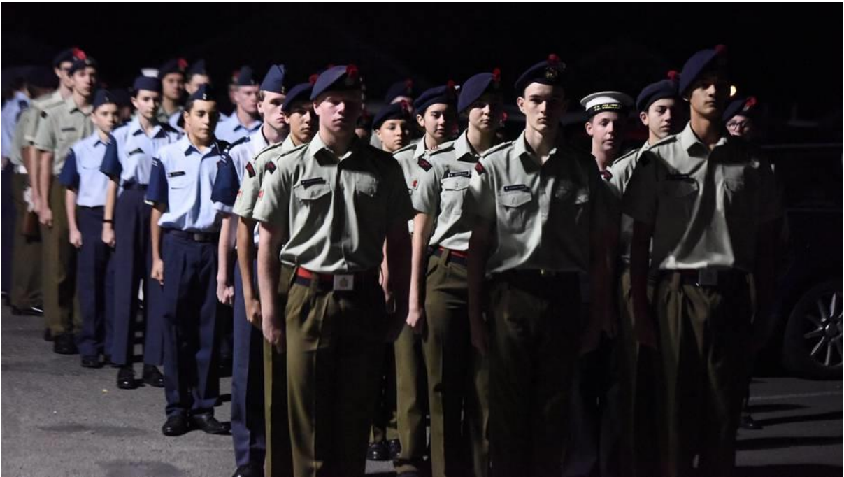
Photographer George Novak captured the moments of Anzac Day dawn service commemorations held in Tauranga.