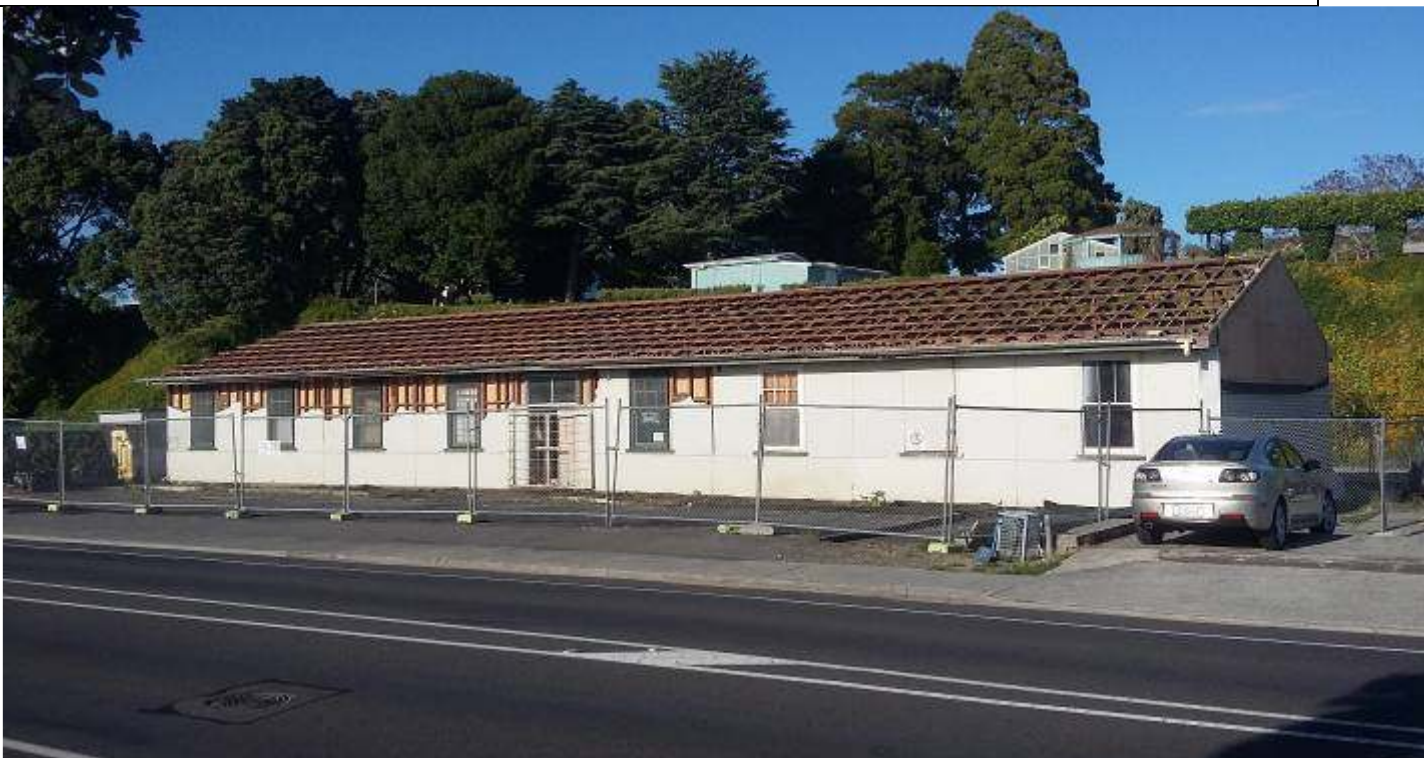
The Army Hall being prepared for demolition – 8 th December 2015