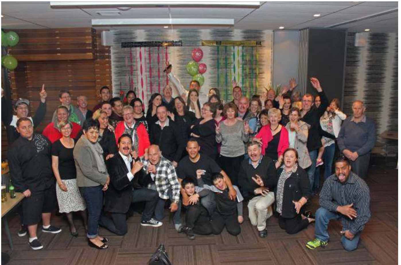
Some of the Guests