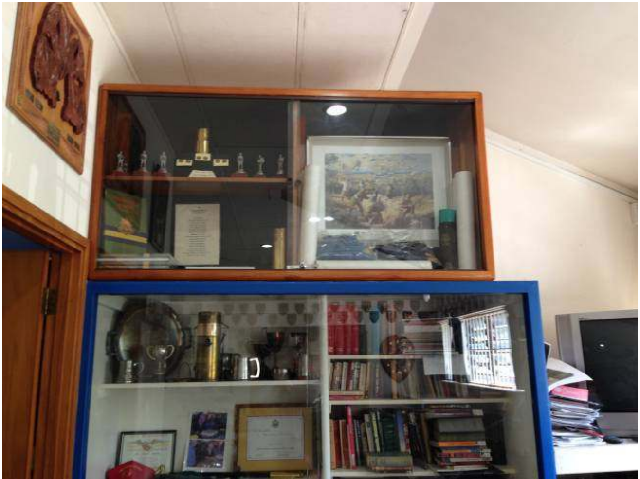
The new location of Hauraki display cabinet