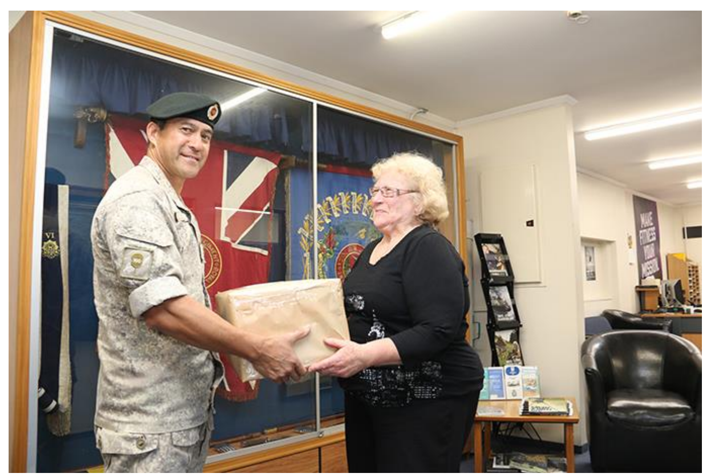
Letter to the troops